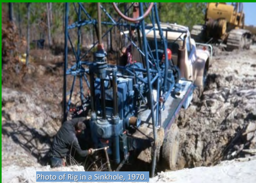
Photo of Rig in a Sinkhole, 1970.