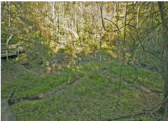
Devil's Millhopper Geological State Park

The first stop is at Devil's Millhopper Geological State Park north of Gainesville where participants can view the Devil's Millhopper, a large collapse sinkhole that penetrated from the Eocene Ocala Limestone through the Miocene Hawthorn Group and younger sediments.