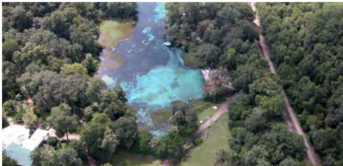
Rainbow Springs State Park

PLEASE NOTE: Hard hats, good field boots and safety vests are required to participate in the trip. Conference organizers cannot provide the necessary safety items. Bring rock hammers and sample collection bags as desired. Lunch and drinks will be provided.