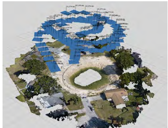
Sinkhole SfM (Structure-from-Motion) Drone Modeling

Introductory and general knowledge of GIS is helpful, with workshop geared toward GIS beginner-level applications.